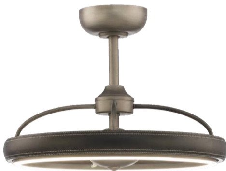
Antique Silver - Black