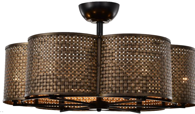
Rattan - Black