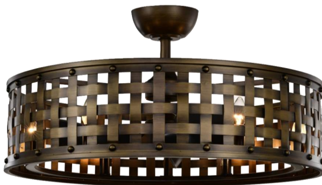
Antique Bronze - Black