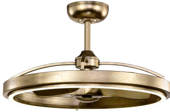
Champagne Foil - Champagne